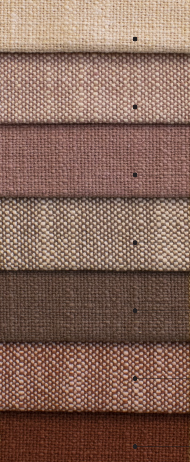
Dis 1805. Col. 09