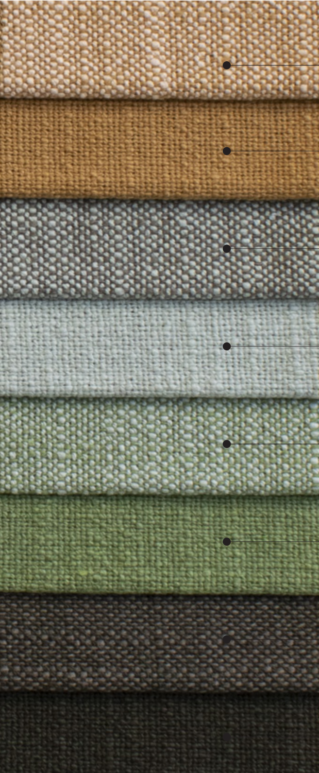
Dis 1806. Col. 17