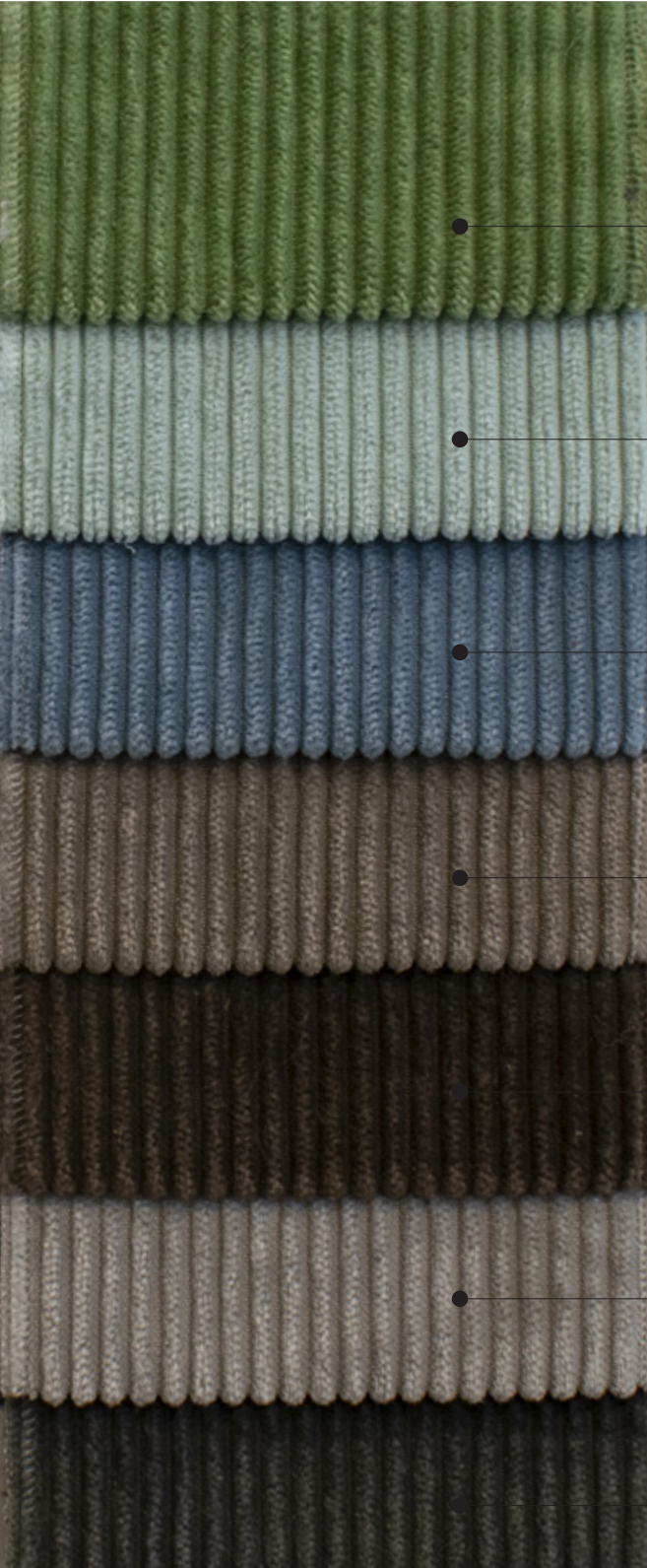
Dis 1800. Col. 11