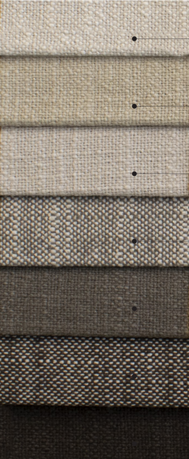
Dis 1806. Col. 01